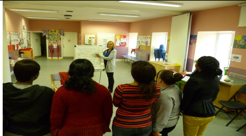
Participants at workshop

Please contact ahtudivision @justice.ie for more information.