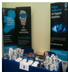
AHTU Information Stand at the ISME Conference in November.

The AHTU had an information stand at the Irish Small and Medium Enterprises (ISME) Annual Conference.