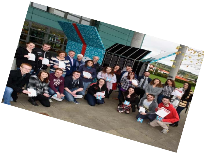
Some law students from LYIT