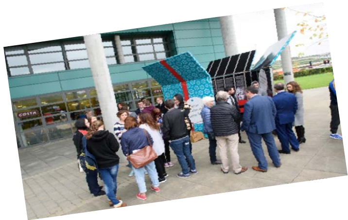
UN GIFT Box on display at LYIT