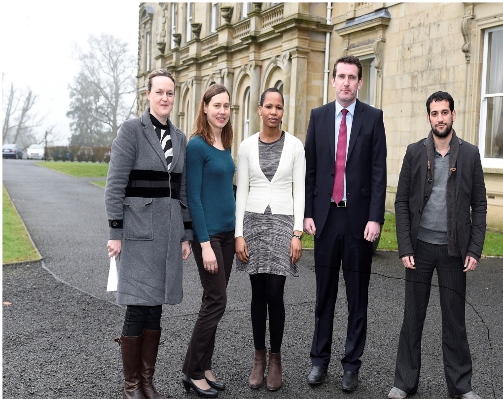
Minister of State, Aodhán Ó'Riordáin, TD with Members of the Migrants Rights Centre Ireland

Presentations from the Conference are available at http://www.blueblindfold.gov.ie/website/bbf/bbfweb.nsf/page/news-publications-en